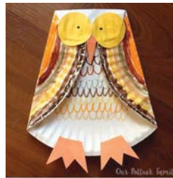
Paper Plate OWL CRAFT